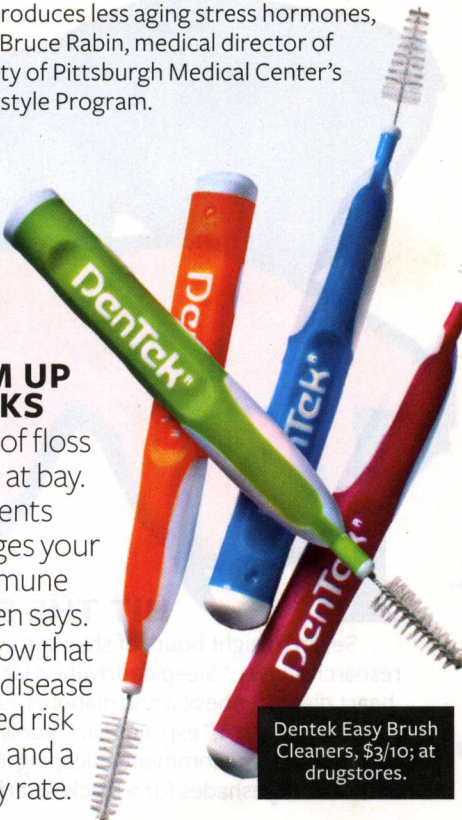
Dentek Easy Brush Cleaners, $3/10; at drugstores.

"Flossing prevents gingivitis, which ages your arteries and immune system," Dr. Roizen says. In fact, studies show that people with gum disease have an increased risk of heart disease and a higher mortality rate.