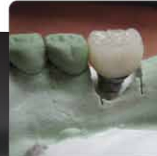
Intrigue custom temporary