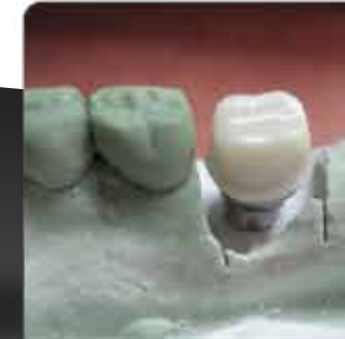
NobelProcera P3™ zirconia coping