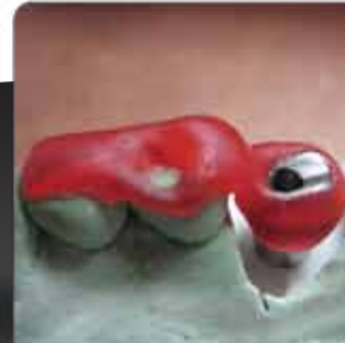
Sure-Fit™ Jig for easy placement