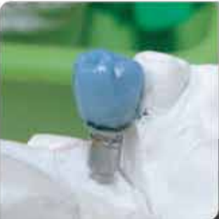
Full contour wax-up with margin line set in black

An interactive approach to making custom milled abutments