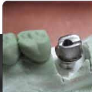
Final custom abutment