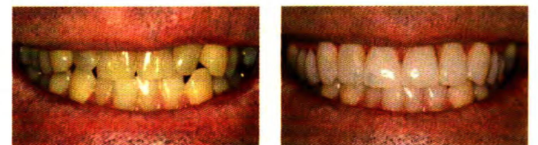
STAINED AND CROOKED TEETH

7 Are your teeth wearing on the biting surfaces? Yes No If yes, explain _____