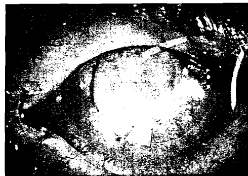
Figure 2. Corneal graft with suture abscess and wound dehiscence.

The frequency of lens removal was also evaluated. The group which developed ulcers had the lens removed and replaced approximately once