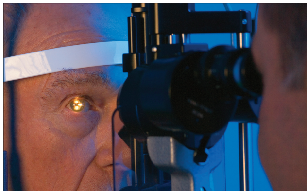
A cataract patient undergoes a slit-lamp exam.

Your surgeon may use additional dilating agents or a device to stabilize your iris to minimize the risk of complications.