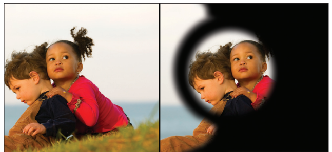
A normal visual field is represented in the image on the left. The image on the right is an example of severely damaged vision.