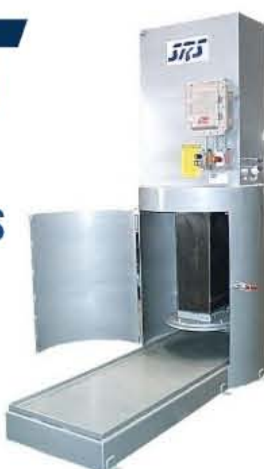
CMP - Series