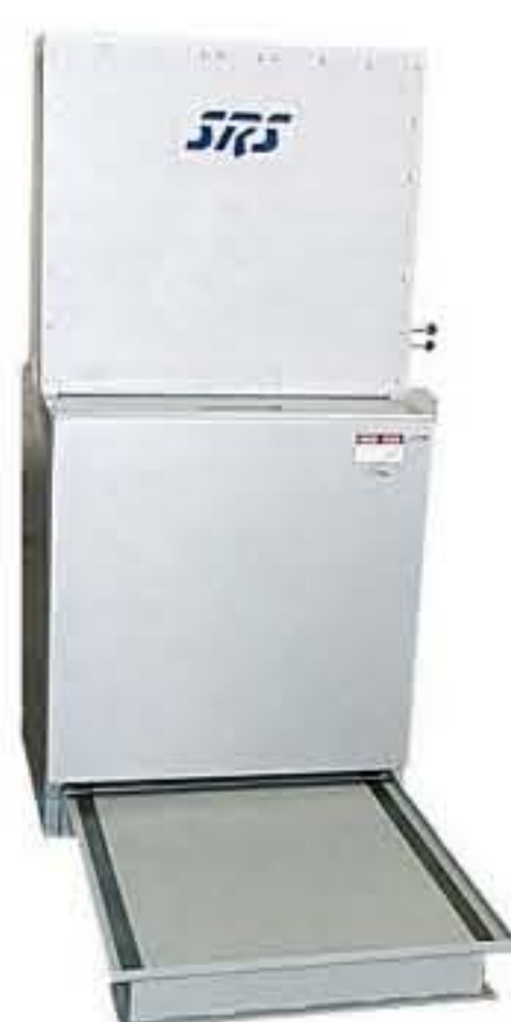
VersApak - Series