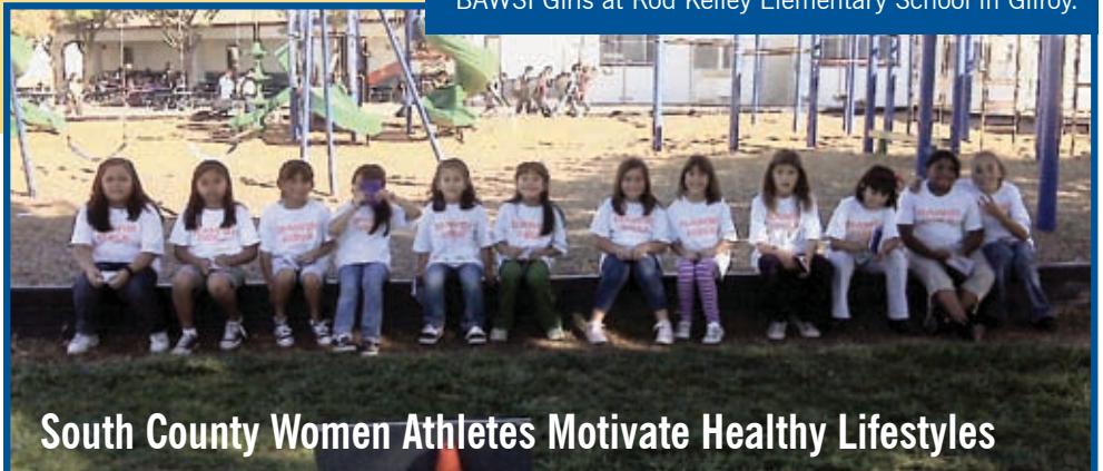
BAWSI Girls at Rod Kelley Elementary School in Gilroy.