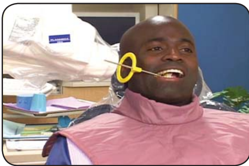
X-rays may reveal a fracture

When the root of a tooth is fractured and cannot be saved, extracting the tooth can be the best choice for relieving pain and preventing infection.