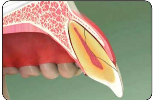
Severely fractured tooth