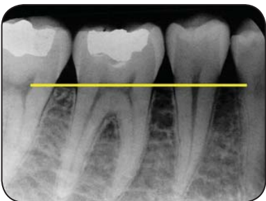
Healthy bone level