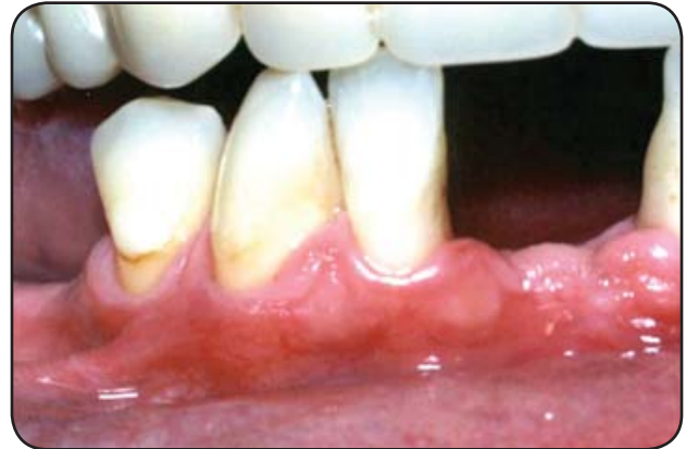
Periodontal disease causes tooth loss