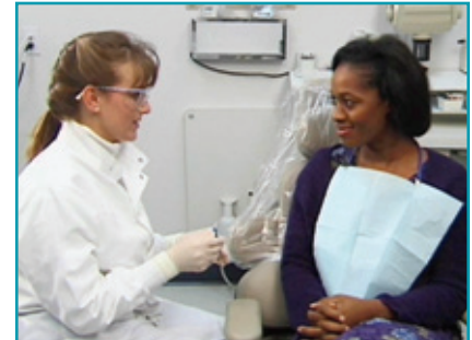
An excellent resource