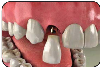
Single tooth implant