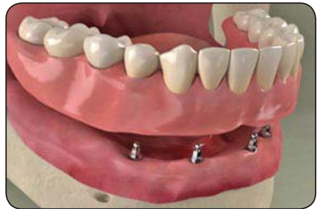
Full arch implant denture

With careful homecare and regular checkups and cleanings here in our office, an implant can be an excellent long-term solution for missing teeth.