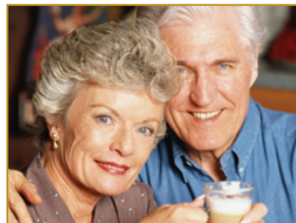
In time, you'll adjust to dentures