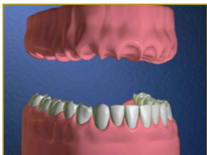
We sometimes can't save teeth

Removing your teeth and replacing them with a denture may be the best way to eliminate the infection caused by periodontal disease and restore the health of your mouth. When this is all done on the same day, it's called an immediate denture.