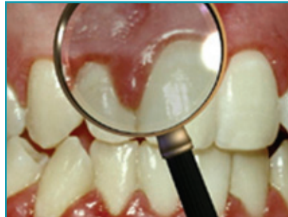
Signs of periodontal disease