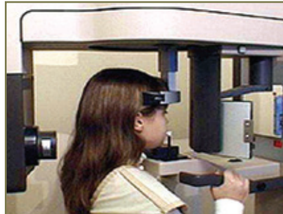
The camera rotates around you