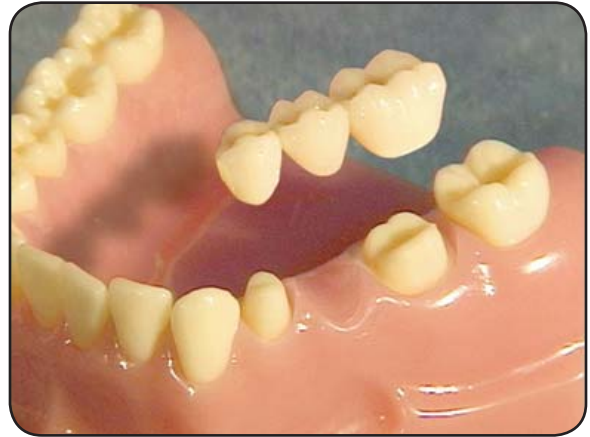
A dental bridge fills the space