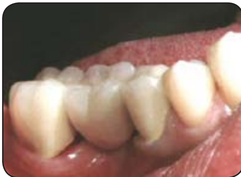
Bridge seated in place