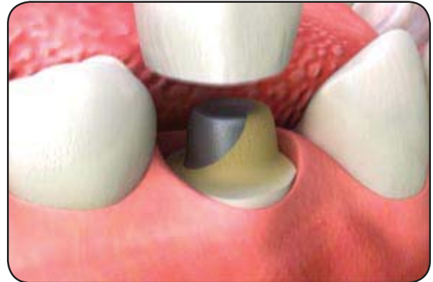
Crown is placed over post & core