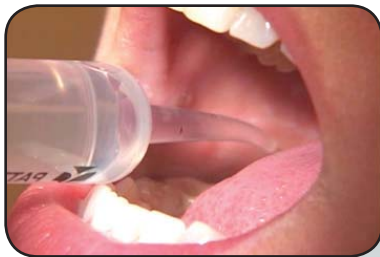
Rinsing with a medicated solution

After your tooth has been extracted, we'll give you complete instructions about caring for your mouth. Following them exactly will help you avoid dry socket. It's especially important to avoid certain behaviors that can cause the premature loss of a blood clot, particularly within the first 24 hours after an extraction.