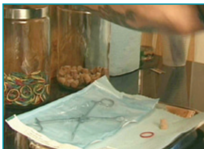
An invasive surgical procedure

Some people who consider tongue or lip piercing may not be aware of all the risks involved. Though the procedure is fairly simple and is normally performed without anesthetic, the consequences can be severe.