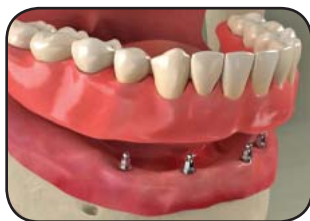
Implant post full arch