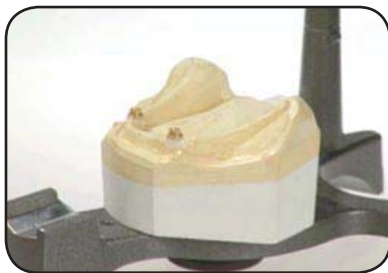
Implant posts on model

Although each case will be different, placing an implant-retained denture generally involves two phases. The first phase is the surgical placement of the implants. The second phase is fitting the dentures over the implants.