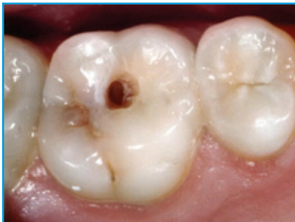
Acid causes cavities

In science classes, you've learned to be very careful with acid. Did you know that you can have acid in your mouth, and that this acid can cause a hole to develop in your tooth?