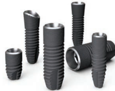
The new ASTRA TECH Implant System™ EV

Summer is in full swing, and so is Eastern Oklahoma Periodontics! We are seeing great results with our new implant system, the Astra Tech EV. From a prosthetic stand point, the restorative platform is much more user friendly than the TX. It is much easier to seat the impression posts and abutments. The new 5.4 diameter implant is also working very well in large molar areas. We are continuing see the great bone stability that we have always seen with Astra's conical connection. Conical connections are where much of the industry is going. Micro-movement at the implant abutment interface makes for a perfect bacteria pump during function. Conical abutment connections, like Astra Tech, help reduce the movement, hence one of the reasons we are seeing such stable bone levels!