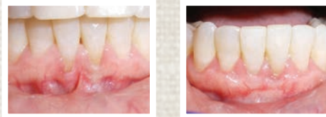
Pre Op Pre Op

Case 3: Tooth #30 presented with a vertical root fracture. It was extracted and socket preservation therapy was performed. Once the socket healed, implant placement was performed. The implant was restored with a custom milled titanium abutment and crown.