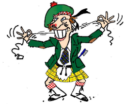
Phil MaCavity says "Just Floss 'Em"