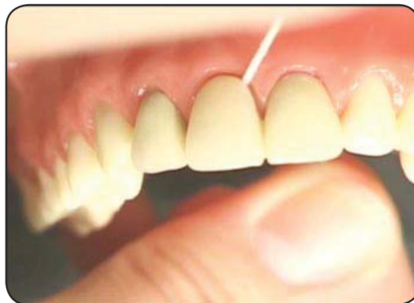
Superflossing a bridge