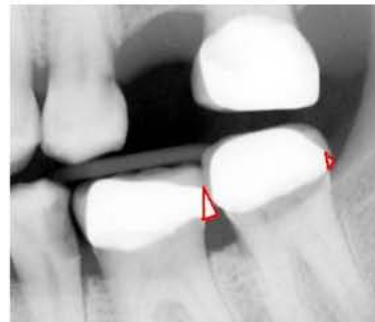
Same X-Ray as on Left...

Showing very large Problem areas in red.