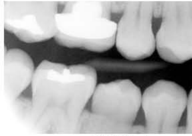
Original X-Ray 1