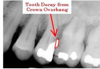
Same X-Ray as on Left...

Showing very large Problem areas in red.