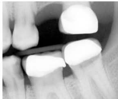
Original X-Ray 3

Showing very large Problem areas in red.