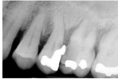
Original X-Ray 2

Showing very large Problem areas in red.