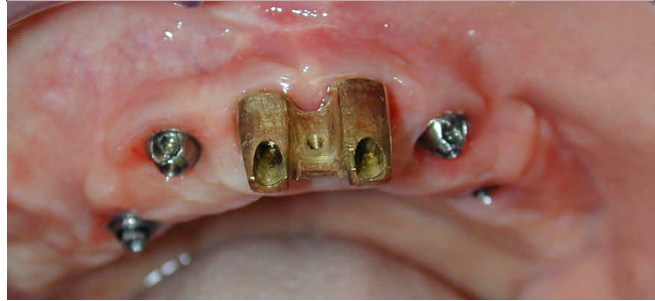
UPPER IMPLANTS IN PLACE