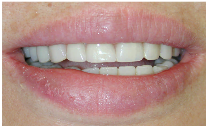
COMPLETED FIXED UPPER AND LOWER PROSTHESIS