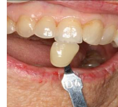
Before Power Bleaching

you perform the very easy at-home maintenance. And you'll be able to drink red wine, coffee, tea, etc.