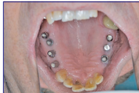
DIAGRAM A. 2 AFTER IMPLANT TREATMENT