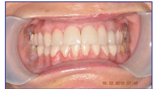
DIAGRAM A.5 BEFORE TREATMENT