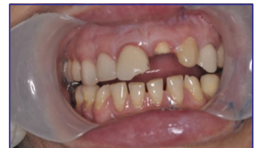
DIAGRAM A.4 AFTER TREATMENT