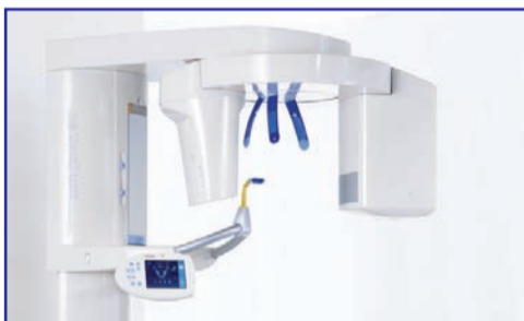
Diagram i.i Showing Cone Beam CT 3D dental scan

With Cone beam technology in a 3 D dimension it will be easier for all dentists in Uganda to diagnose illnesses, find location of infections, cancers and see cracks in teeth which many times are not visible on 2D x-ray machines.