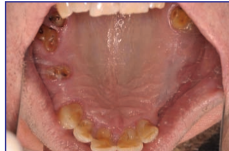
DIAGRAM A. 2 DURING IMPLANT TREATMENT